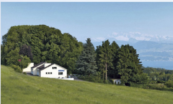
Bio-Strath production in Herrliberg

Distributors in more than 50 countries also form an important part of Bio-Strath; after all, 70 percent of Strath products are exported.