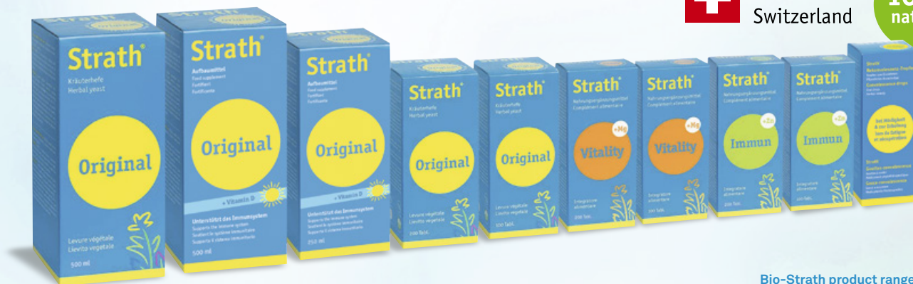
Bio-Strath product range